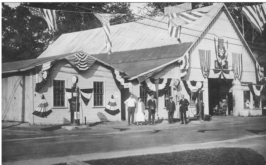
The Museum as Osborne's Garage Decked out for Sunapee's 150 th Anniversary in 1918