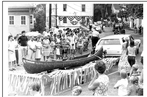
Bicentennial Parade heads down Central Street

7pm at Sunapee's Community Methodist Church on Lower Main Street Free, open to all. Refreshments after.