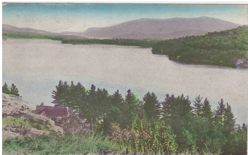
Lake Sunapee, N. H.